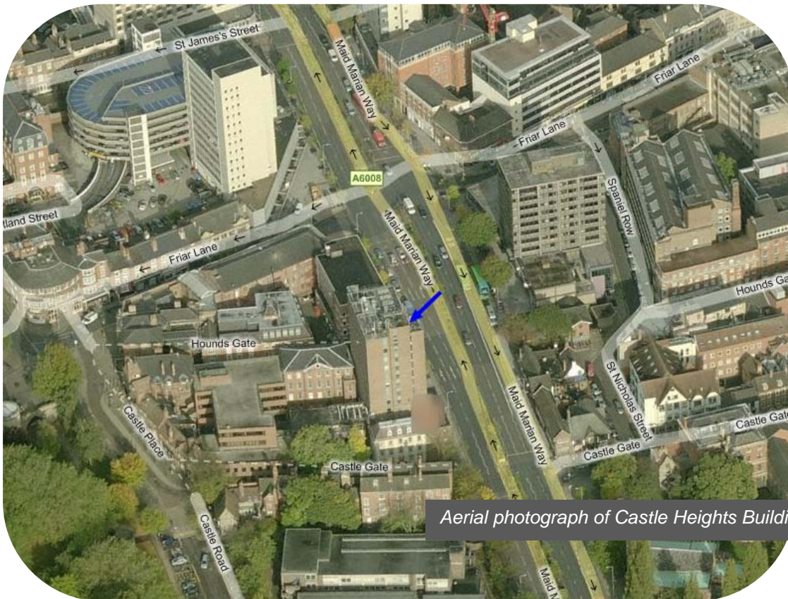
Aerial photograph of Castle Heights Building (arrowed).

*Directions last updated 27 th September, 2011.